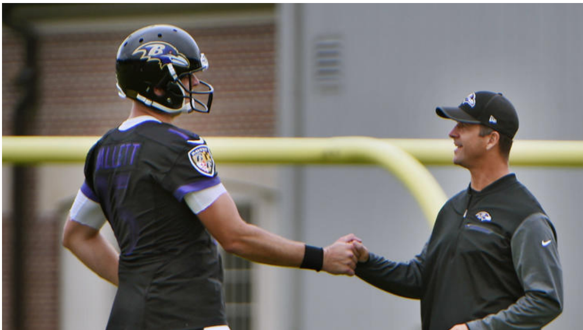
Photos from 2017 training camp of the Baltimore Ravens

"It blends together somewhat in that there's this unified competitive nature," he said in a 2015 interview. "Even in math, when I'm trying to solve a problem, I get very competitive about it. But it's different in that for football, I just love the physicality of it. In math, there's real elegance to it. There's beauty in taking this construct, which we have made, and using it to explain this fantastic and complex world we live in."